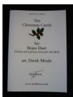
TEN CHRISTMAS CAROLS for brass duet Treble clef (TC) and bass clef (BC) parts. For two brass instruments of same pitch.