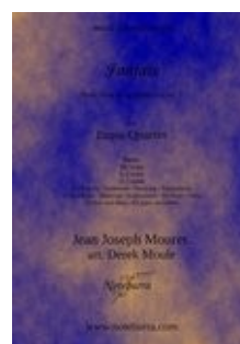
FANFARE from 'Suite de Symphonies' Famous piece by Mouret arranged for brass quartet.