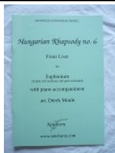
LISZT: HUNGARIAN RHAPSODY NO. 6 Great extended concert or contest solo for euphonium (treble or bass clef) & piano