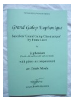
GRAND GALOP EUPHONIQUE Arrangement of Liszt's virtuosic 'Grand Galop Chromatique' for euphonium & piano